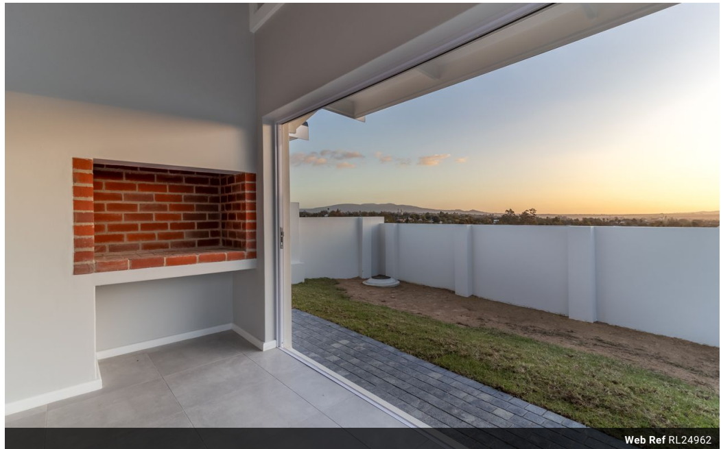
Web Ref RL24962