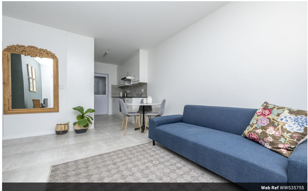
Web Ref WWS35755