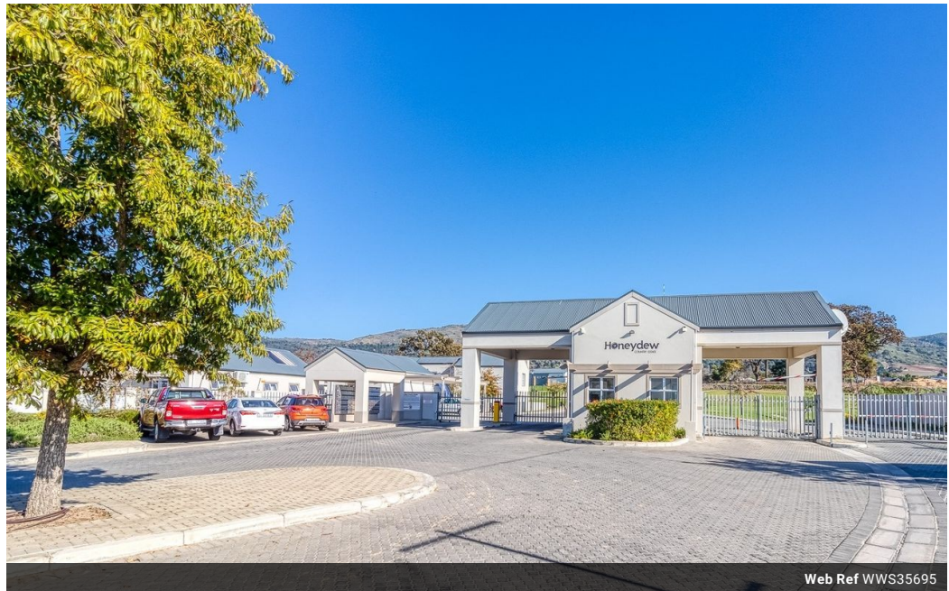
Web Ref WWS35695