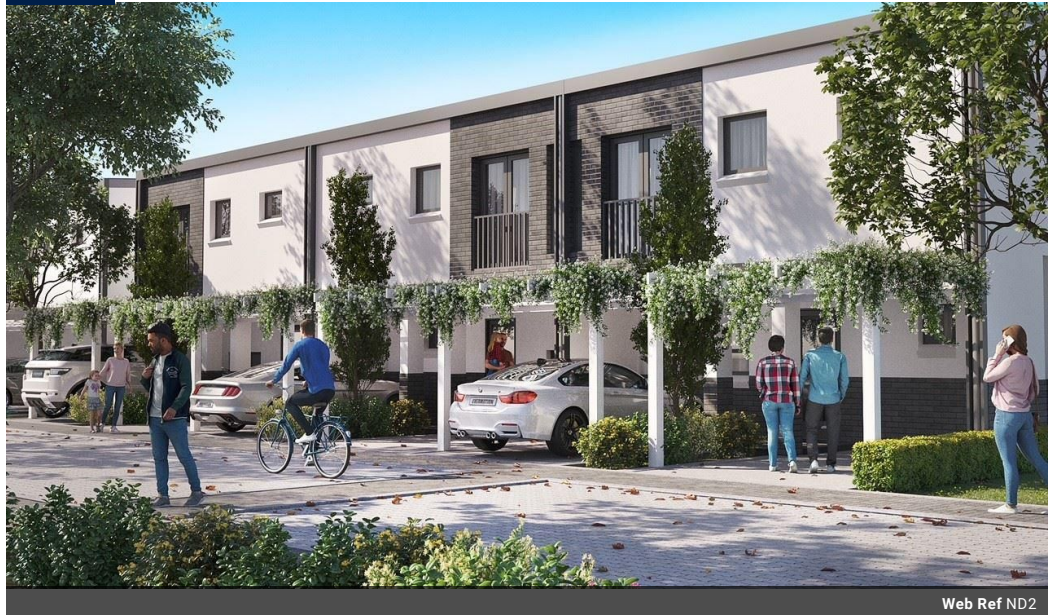
Web Ref ND2